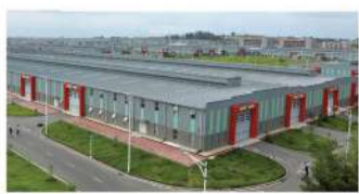
Serviced Land & shed