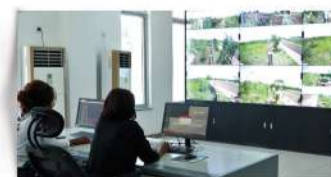
24/7 security service