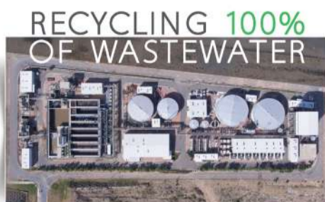
ZERO LIQUID DISCHARGE